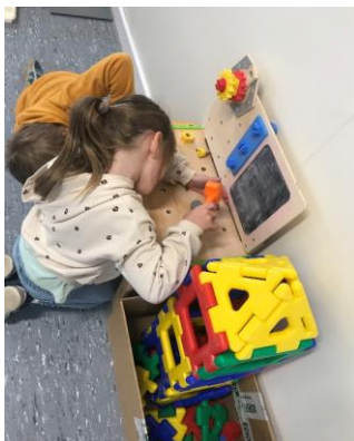
Constructing a Restaurant / Drawing plans/Serving time